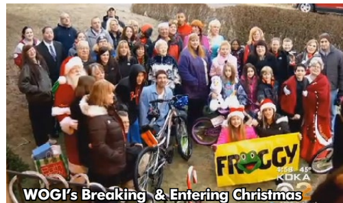
WOGI's Breaking & Entering Christmas