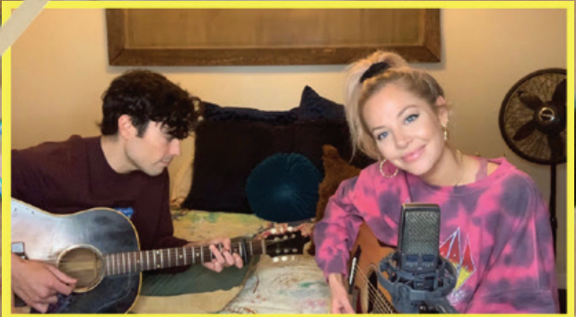
2020 VIRTUAL RADIO TOUR

THANK YOU COUNTRY RADIO FOR A GREAT START