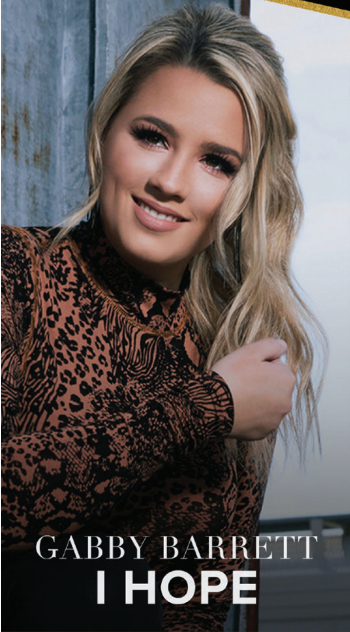
GABBY BARRETT I HOPE

NEVER IN THE RECORDED HISTORY OF COUNTRY AIRCHECK HAVE TWO DEBUT FEMALES HAD BACK TO BACK NUMBER ONE SINGLES. UNTIL NOW.