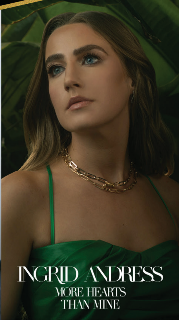
INGRID ANDRESS MORE HEARTS THAN MINE

THANK YOU COUNTRY RADIO FOR MAKING HISTORY!