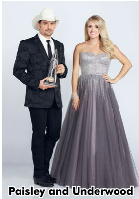
Paisley and Underwood

Part of that is avoiding advance critiques of jokes from artist camps. Underwood explained they've never intended to give offense. "We try to pick on people who can laugh at themselves," she said. "We've been wrong a time or two, but hey. We tried."